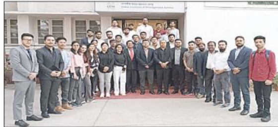
Participants posing for a group photograph at IIM Jammu.