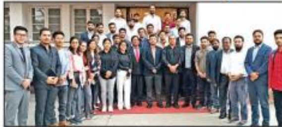
Participants of CBP posing for a photograph at IIM Jammu.